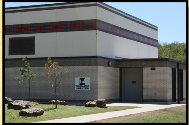
Tornado Shelter made possible by a Tornado Safe Room Grant