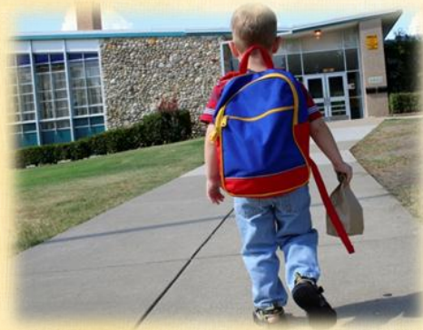
Safe Routes to School Grants